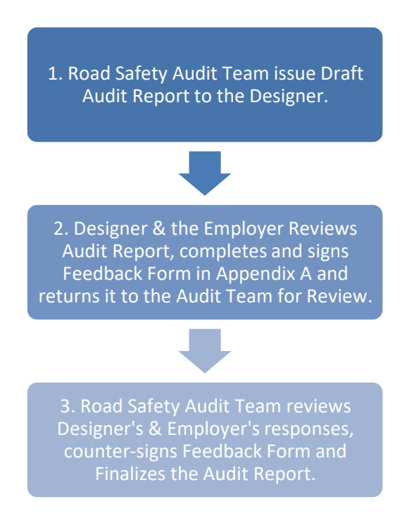
Figure 4.1 - Road Safety Audit Sign-Off and Completion Process

When completed, this form should be signed by the Designer and returned to the Audit Team for consideration. See flow-chart following for further description.