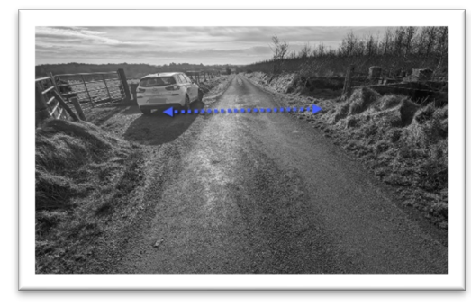
Figure 2.2 – Road Crossings - Access Junction B (Left) & Access Junction C (Right)

A number of the site access road approaches are long and straight. This could lead to higher approach speeds and 'failing to stop' type conflicts on the Local Roads.