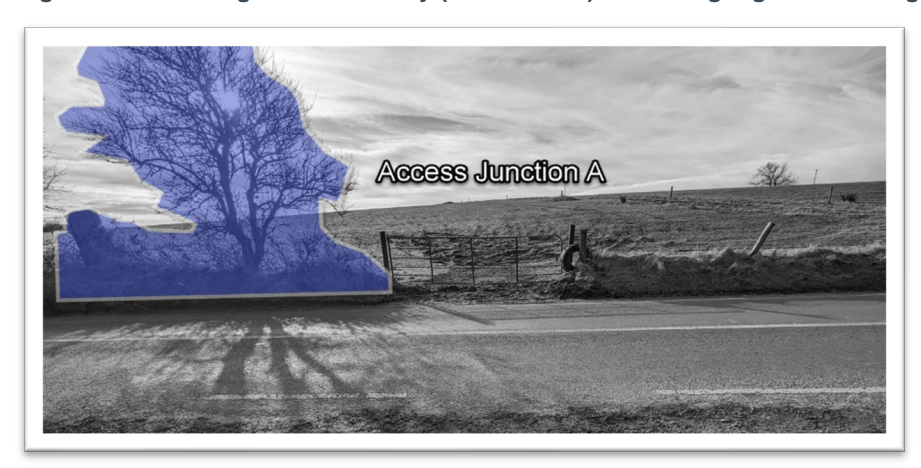
Figure 2.1 – Existing Field Boundary (shaded blue) Obscuring Sight Line to Right

A driver's line of sight to approaching westbound traffic travelling on the R328 appears to be partially obscured by an existing field boundary. This is likely to increase the risk of conflict on the R328 in proximity to the temporary wind farm access during the construction period.